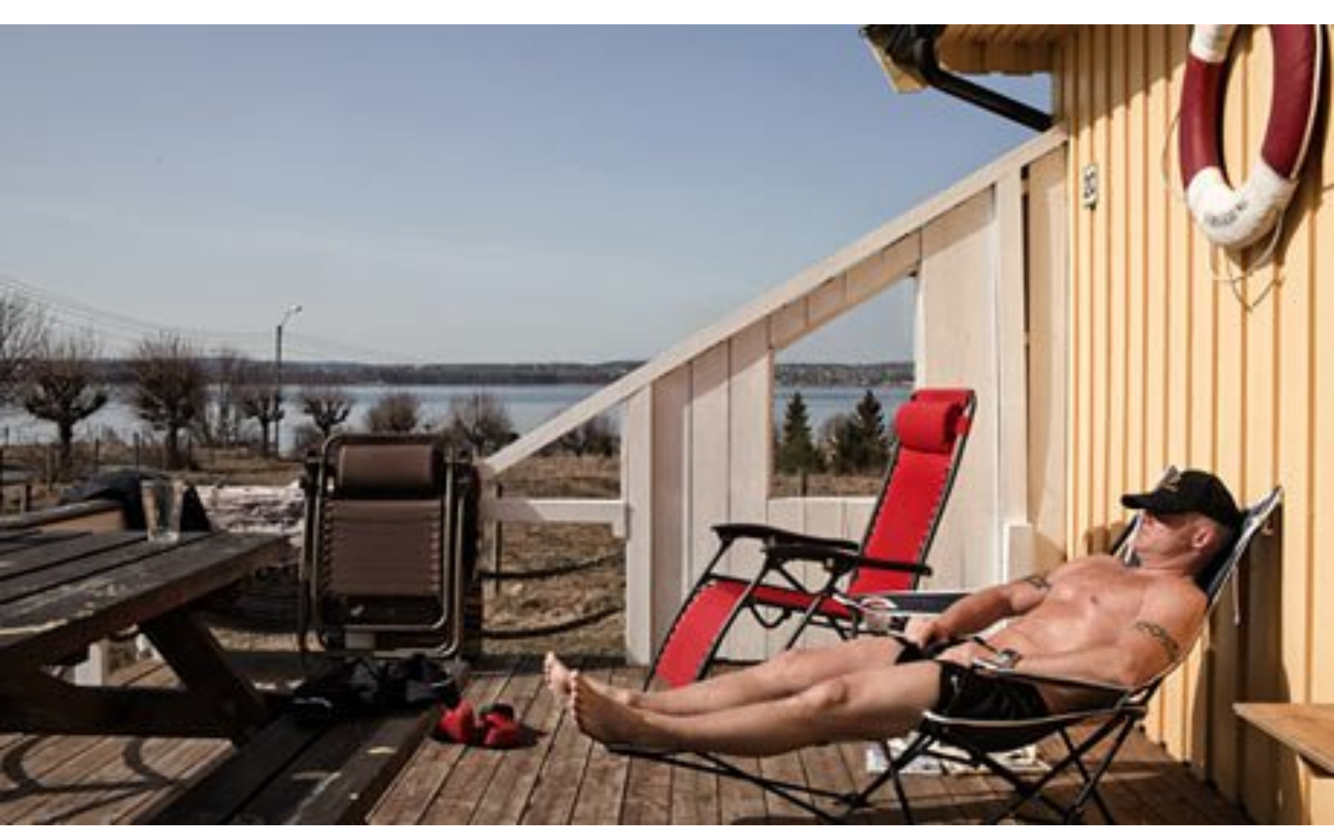
An inmate sunbathes on the deck of his bungalow on Bastoy.

On Bastoy prison island in Norway, the prisoners, some of whom are murderers and rapists, live in conditions that critics brand 'cushy' and 'luxurious'. Yet it has by far the lowest reoffending rate in Europe